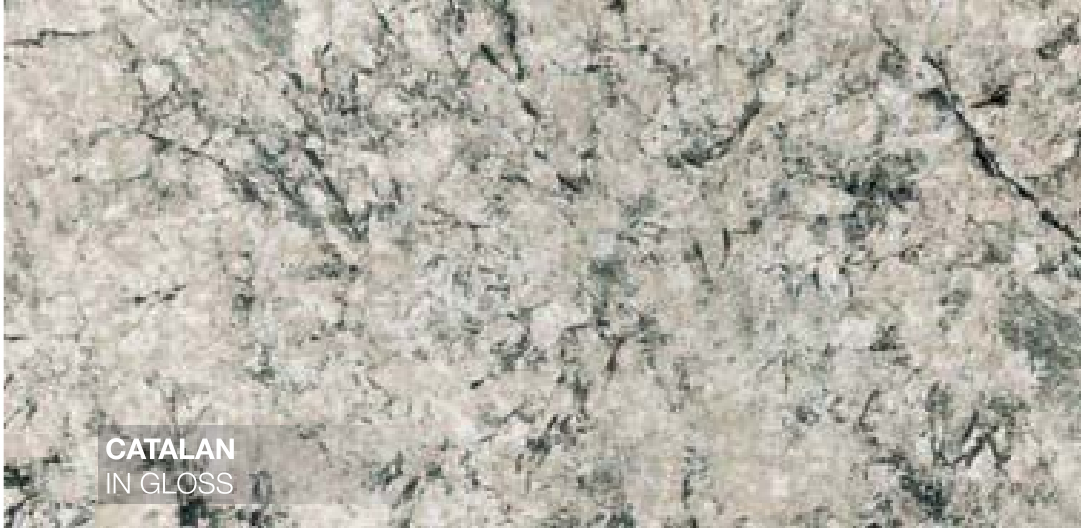
CATALAN IN GLOSS