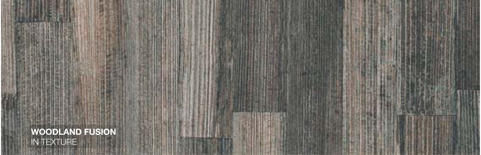
WOODLAND FUSION IN TEXTURE