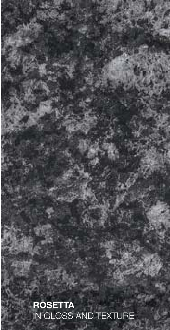
ROSETTA IN GLOSS AND TEXTURE