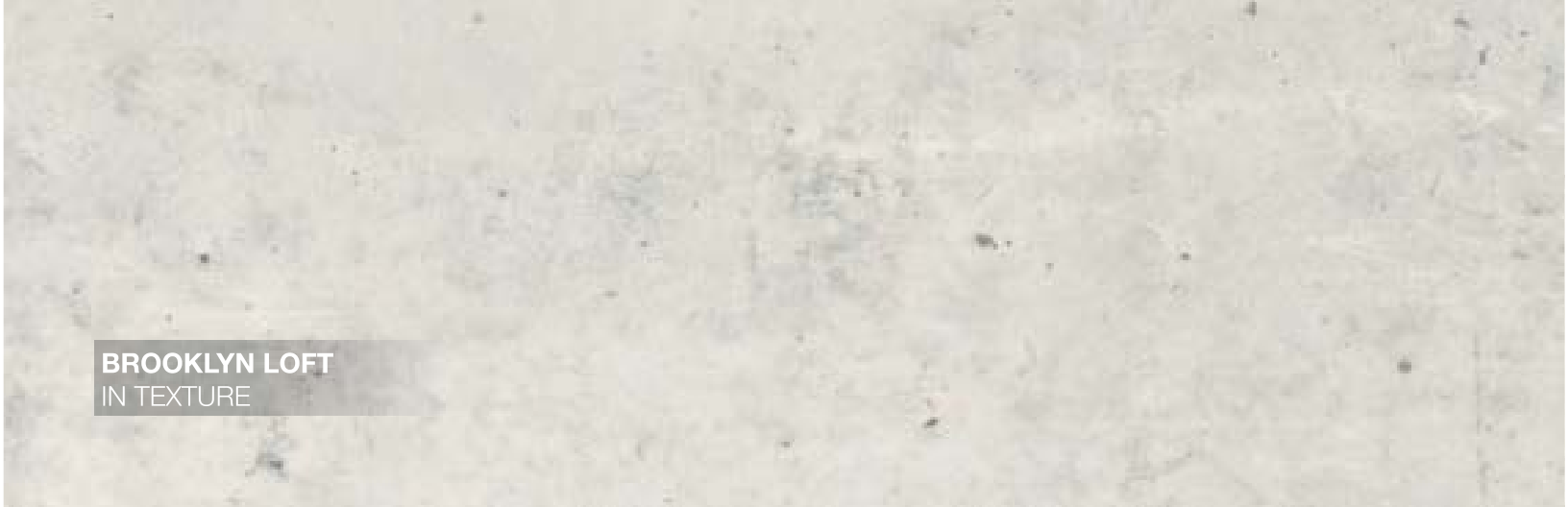
BROOKLYN LOFT IN TEXTURE