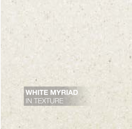
WHITE MYRIAD IN TEXTURE