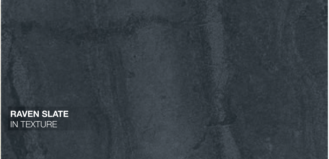
RAVEN SLATE IN TEXTURE