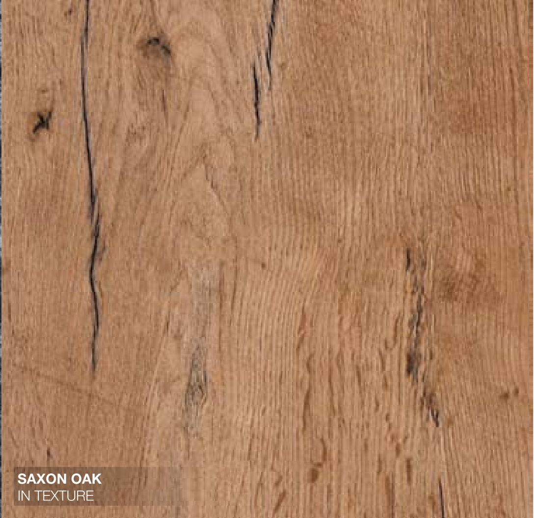
SAXON OAK IN TEXTURE