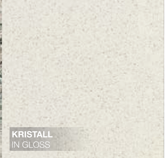
KRISTALL IN GLOSS