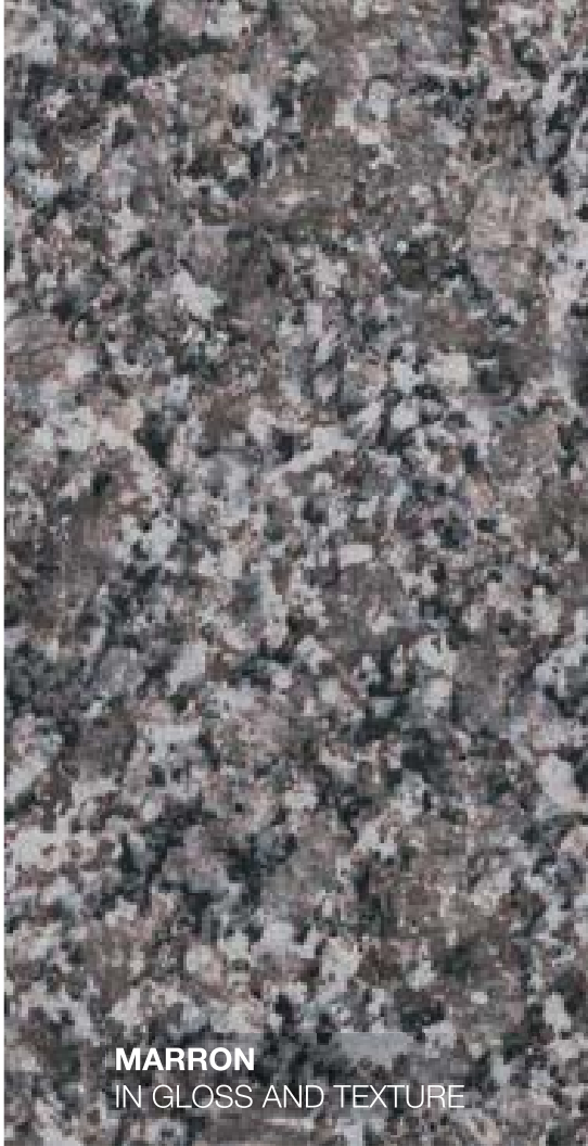
MARRON IN GLOSS AND TEXTURE